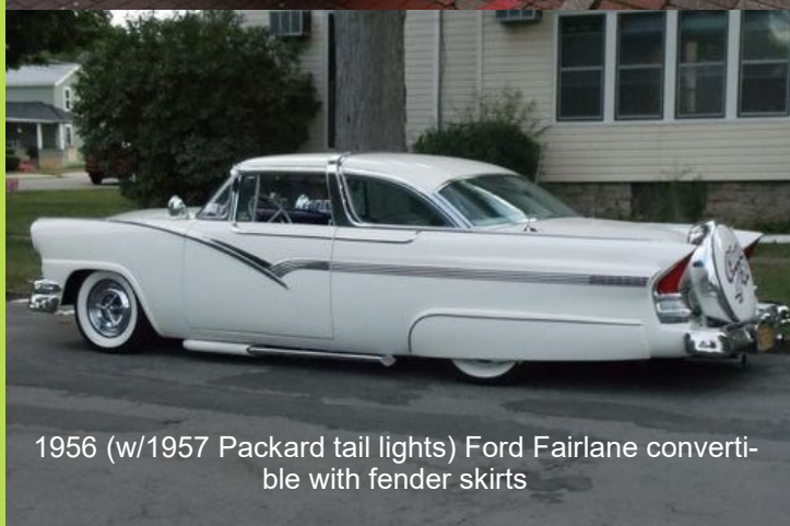
1956 (w/1957 Packard tail lights) Ford Fairlane convertible with fender skirts