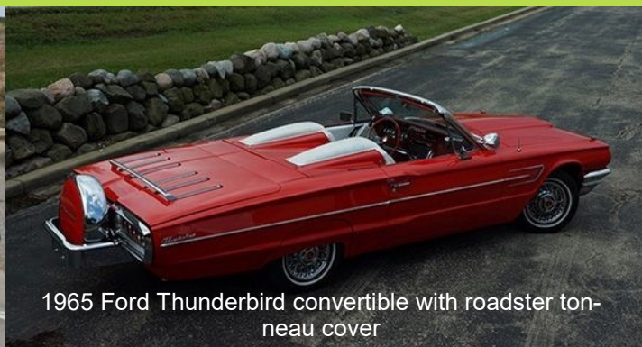
1965 Ford Thunderbird convertible with roadster tonneau cover