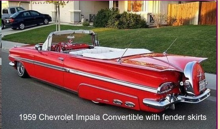
1959 Chevrolet Impala Convertible with fender skirts