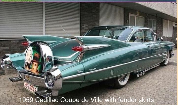
1959 Cadillac Coupe de Ville with fender skirts