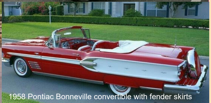
1958 Pontiac Bonneville convertible with fender skirts