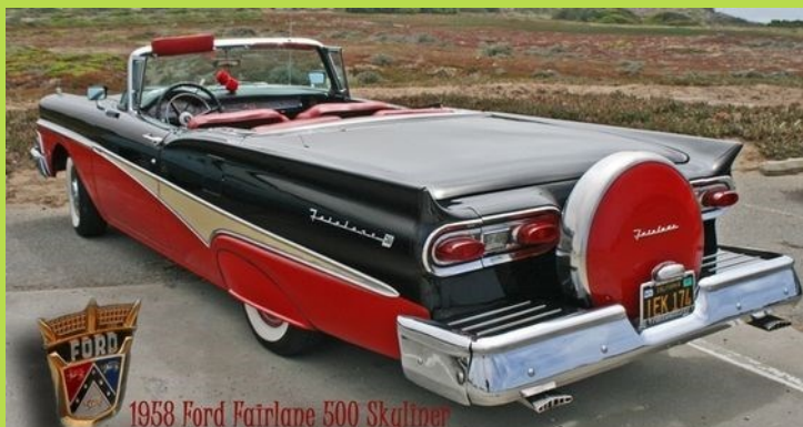
1958 Ford Fairlane 500 Skyliner