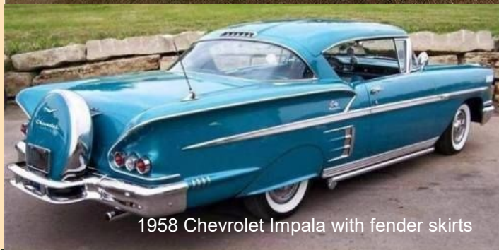
1958 Chevrolet Impala with fender skirts