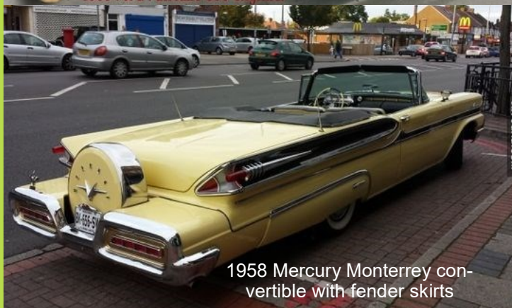
1958 Mercury Monterrey convertible with fender skirts