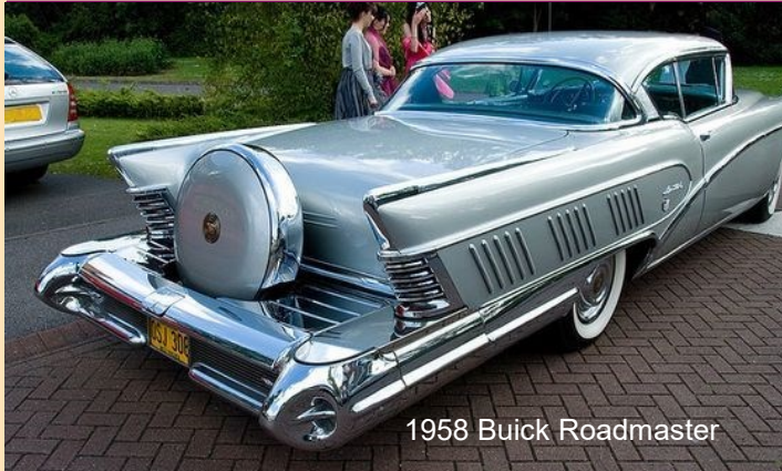
1958 Buick Roadmaster