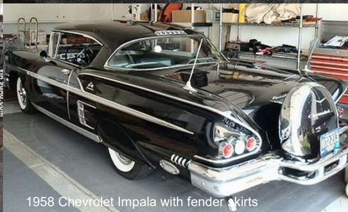
1958 Chevrolet Impala with fender skirts