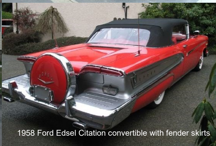
1958 Ford Edsel Citation convertible with fender skirts