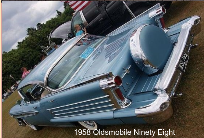
1958 Oldsmobile Ninety Eight