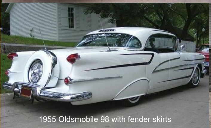
1955 Oldsmobile 98 with fender skirts