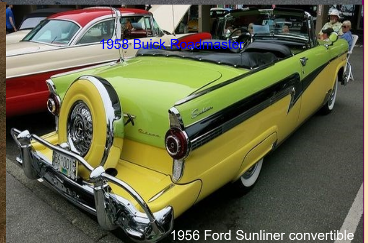
1958 Buick Roadmaster